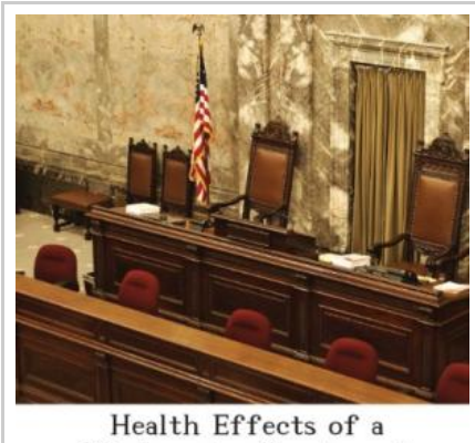
Health Effects of a Wastewater Treatment System